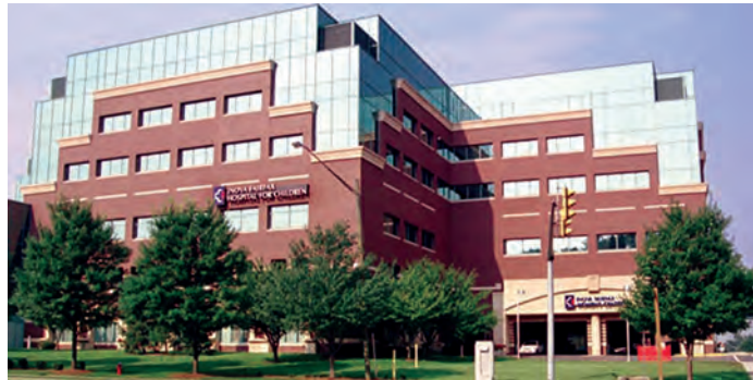
Inova Fairfax Hospital for Children

Source: Fairfax County Department of Systems Management for Human Services, 2006 Rental Housing Census Analysis