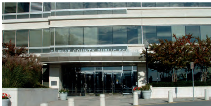
Fairfax County Public Schools' headquarters building